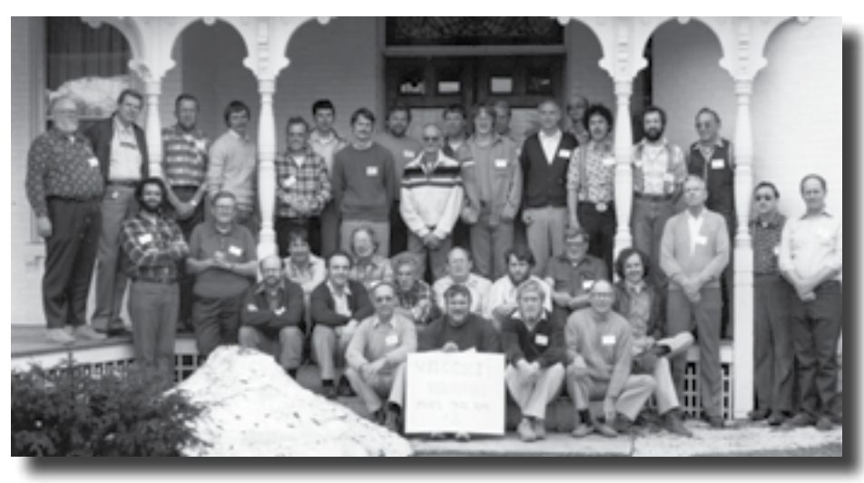
Men's Tres Dias #1 April 22-25, 1982