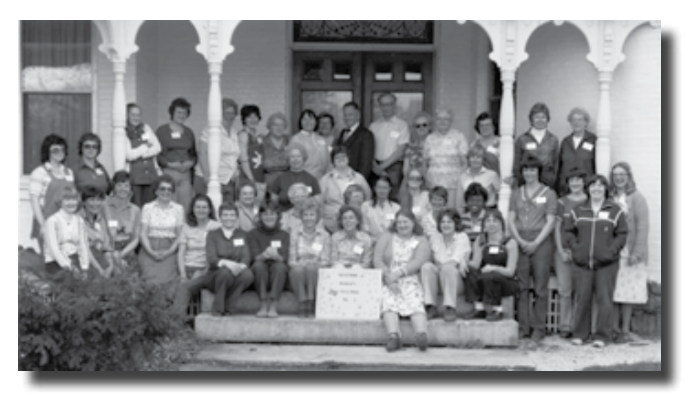
Womens Tres Dias #1 May 6-9, 1982