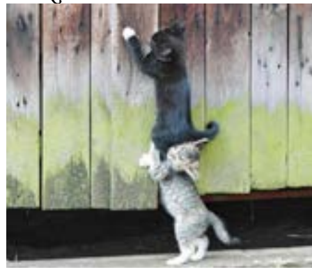
Give a Helping Hand