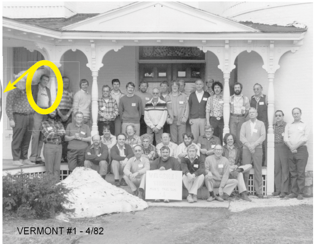
VERMONT #1 - 4/82